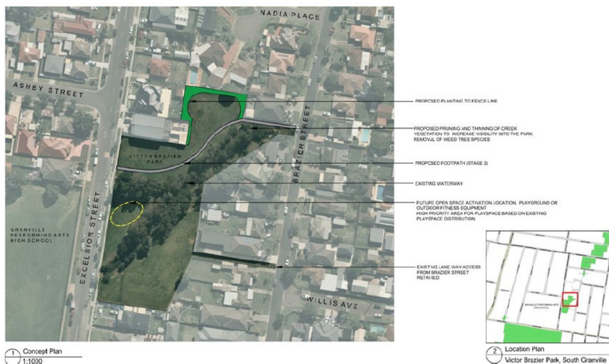
Figure 3 Concept plan for northern portion of the park