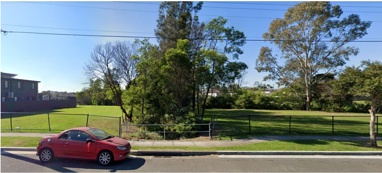
Figure 2 Street view of Victor Brazier Park from Excelsior Street, Granville