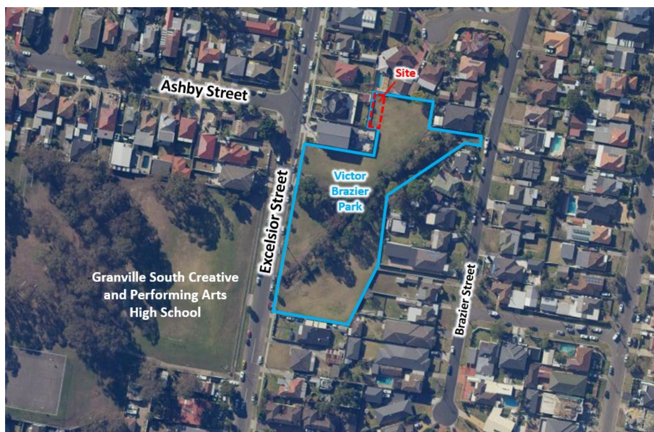
Figure 1 Aerial photograph of the site context

The surrounding area is predominantly characterised by low density, detached residential dwellings and pedestrian laneways. The park is located 2km west of Guildford train station and is not within any of Cumberland's local or strategic centres. The Granville South Creative and Performing Arts High School is located to the east on the opposite side of Excelsior Street. (Figure 1).